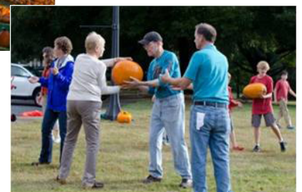
Scenes from the Pumpkin Patch