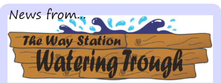
...The Way Station After School Program