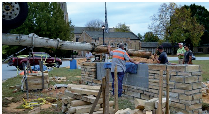
Work continues on the Front Circle with completion expected in November. Enhancements include a new sign, beautiful cross, and sidewalks across the circle. This work should make the space more usable for a variety of events and enhance the beauty of our campus.

This year's Christmas offering will enable our 2014 Student Ministries Kenya Mission Team to complete work on the Mercy Preschool's buildings. More information will be sent by mail.