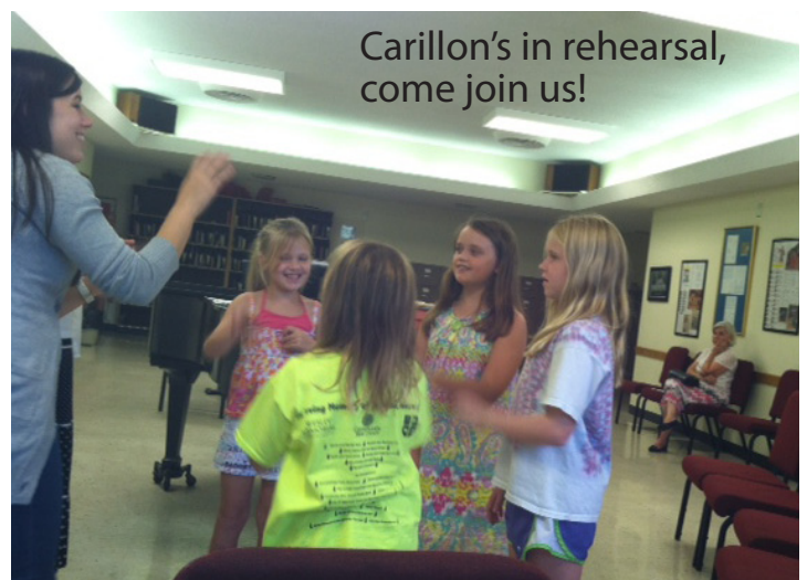
Carillon's in rehearsal, come join us!

From Music in Church Education with Children. Copyright (c) 1970 Choristers Guild. Used by permission.