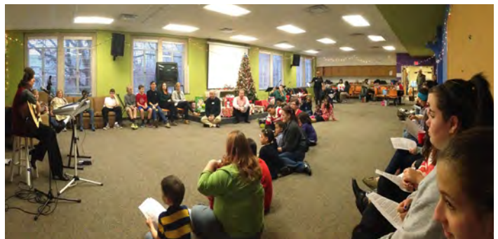
The Advent season for Student Ministries was not just about receiving gifts but about sharing gifts. This Advent, Student Ministries packed backpacks for students at Fairview Elementary, gathered supplies and assembled health packets for the homeless of our community and hosted the Jail Ministry Christmas Party.