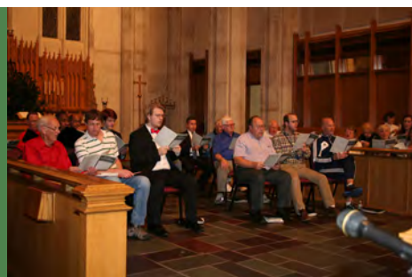
Chancel Choir Rehearsal