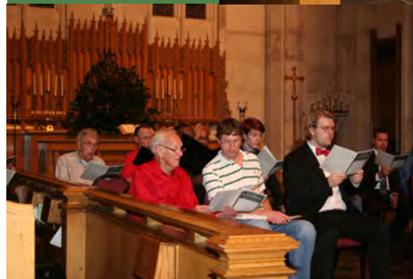
Chancel Choir Rehearsal