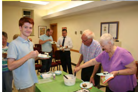
Chancel Choir Celebration