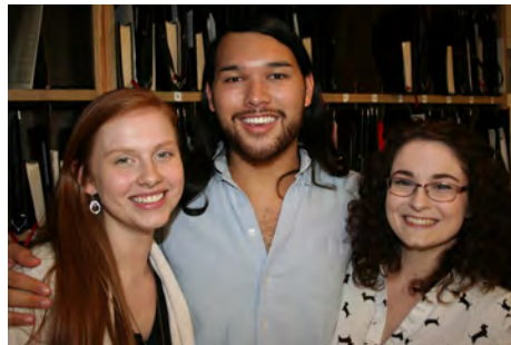
2016 Departing Wesley Singers