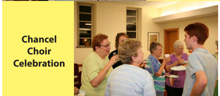
Chancel Choir Celebration