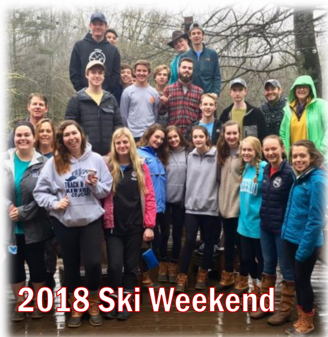
2018 Ski Weekend

January 25-27 Ski Weekend Teen Valley Ranch